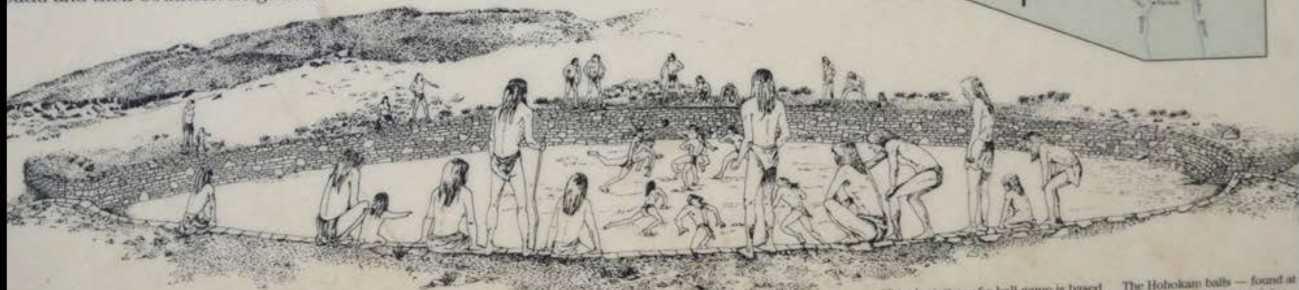
This depiction of a ball game is based on descriptions of games played by the Mayan and Aztec cultures of Mexico and speculations on the Hohokam games in southern Arizona.