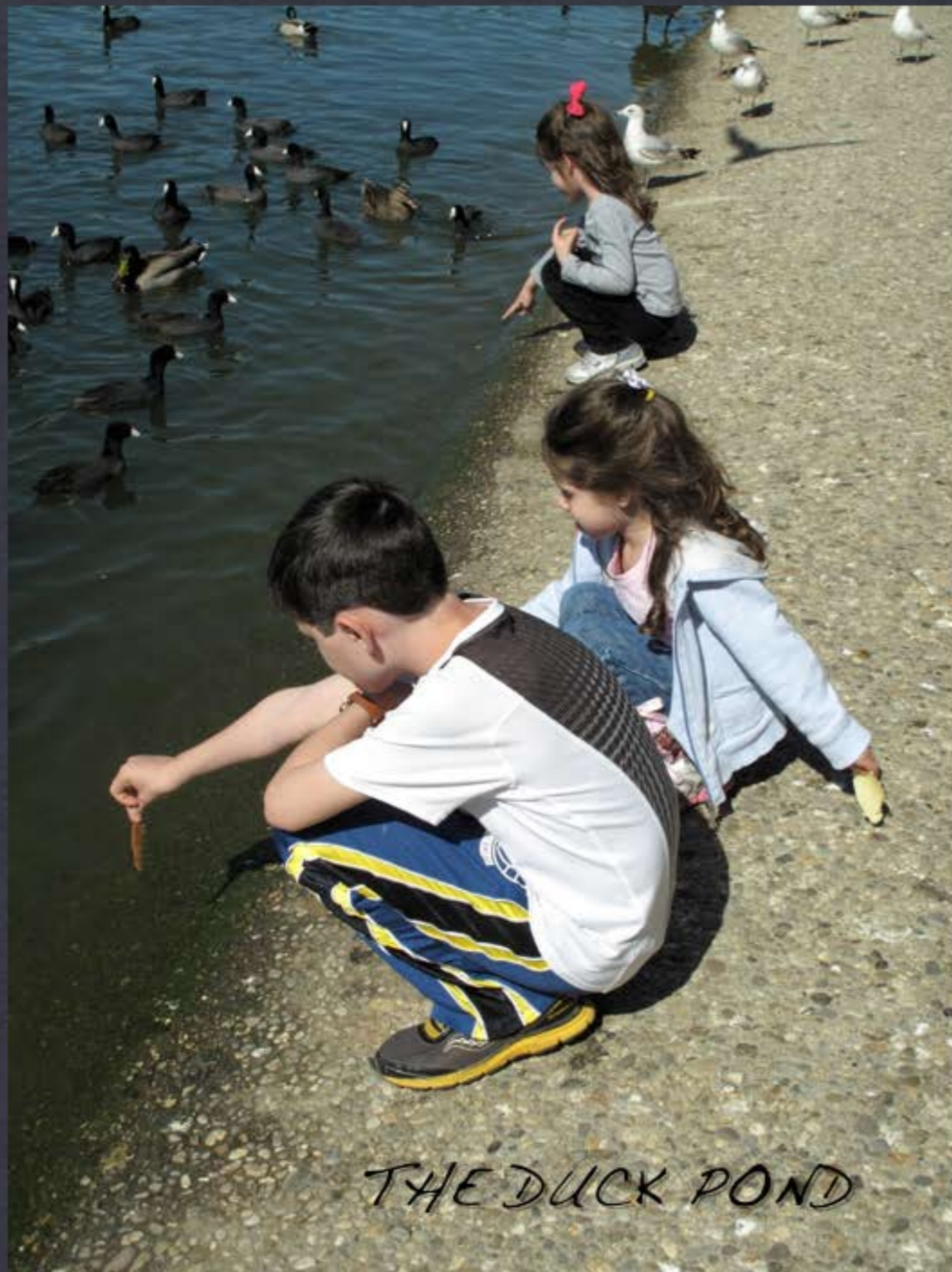
THE DUCK POND